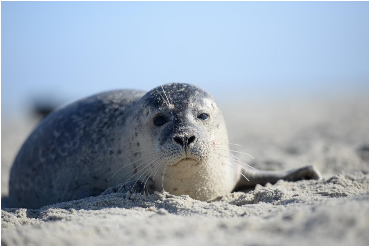
Harbour seal in the Wadden Sea.