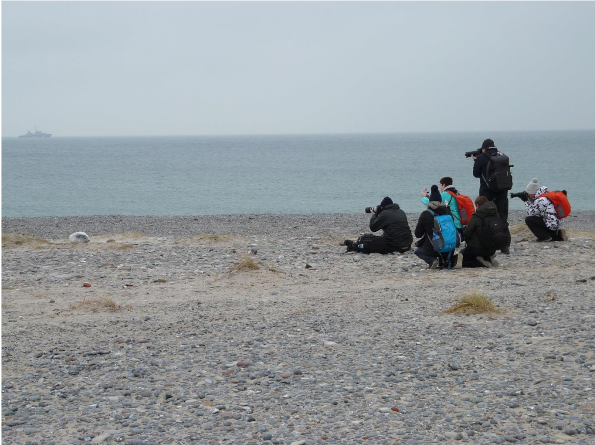
On Helgoland, grey seals are exposed to a steady presence of tourists

General growth but local drop in numbers