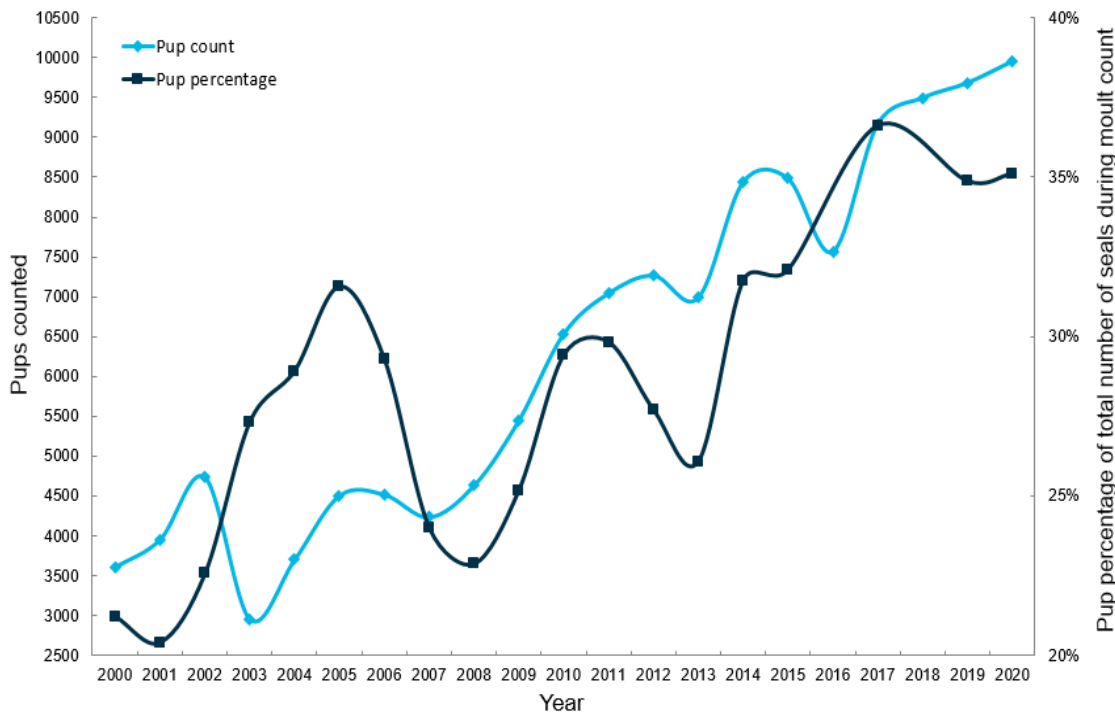
Figure 1. Number of pups counted in the Wadden Sea in June (left y-axis, light blue) in the years 2000-2020. The number of pups as a percentage of the total number of seals counted during the moult count (right y-axis, dark blue line.)