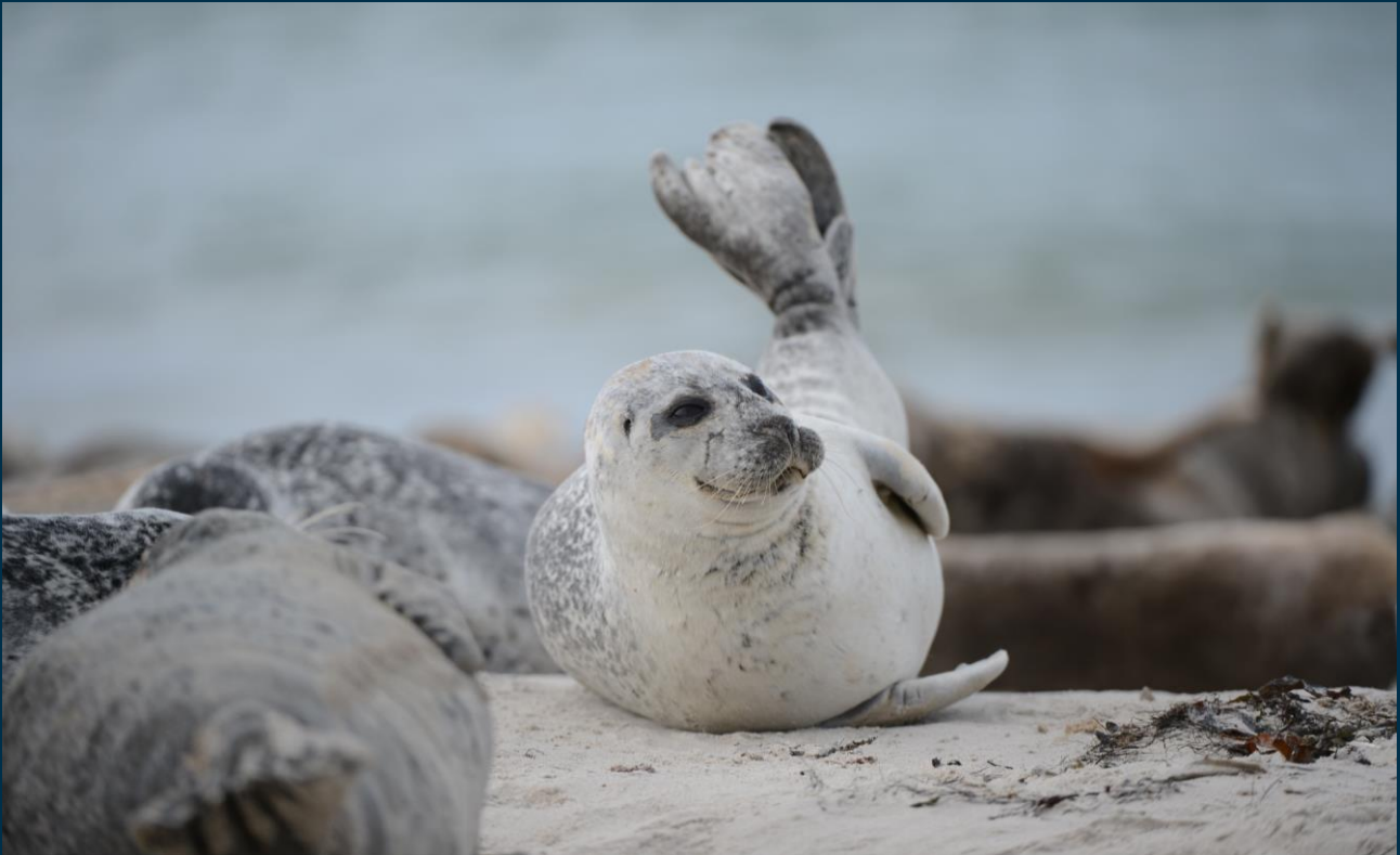
Harbour seal on sand bank. Casper Tybjerg, TTF, Fisheries and Maritime Museum Esbjerg.